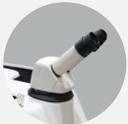
10X Stereo Microscope

Designed for efficiency in compact environments, its portable and space-saving form fits seamlessly into smaller workspaces. It features an ergonomic armrests for enhanced comfort, low operating noise, and single cooling system.