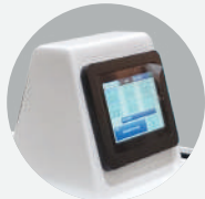
5" Screen with Intuitive Interface