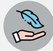
Portable & Lightweight