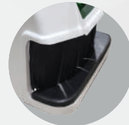
Ergonomic Arm Support